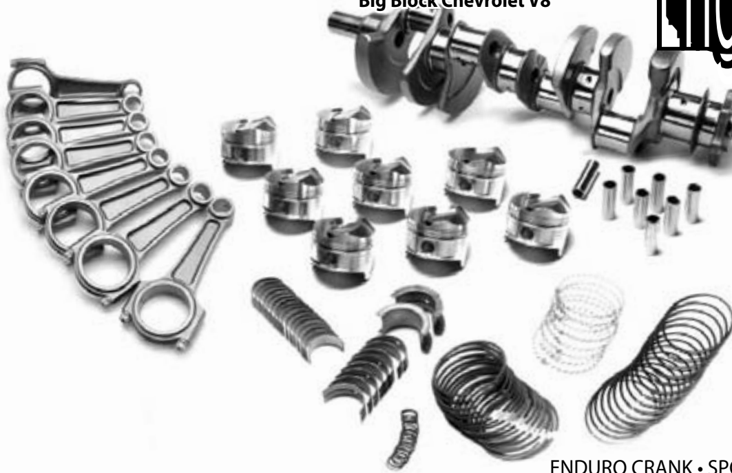
Big Block Chevrolet V8