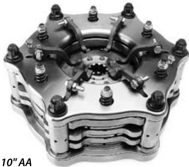
10" AA FULL TITANIUM GLIDE