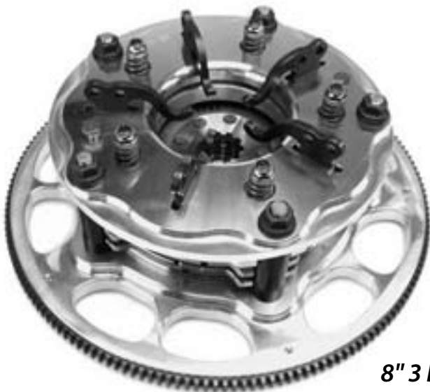
8" 3 DISC GLIDE