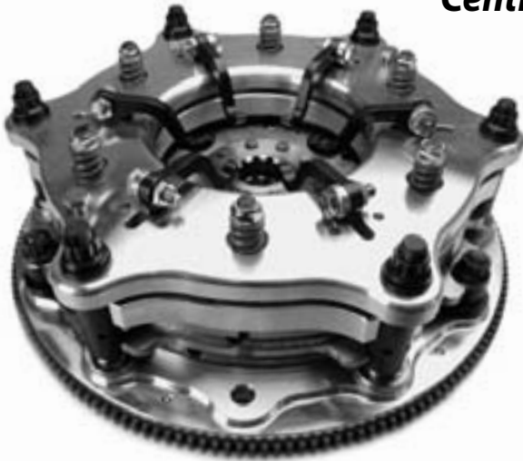
11" 2 DISC GLIDE